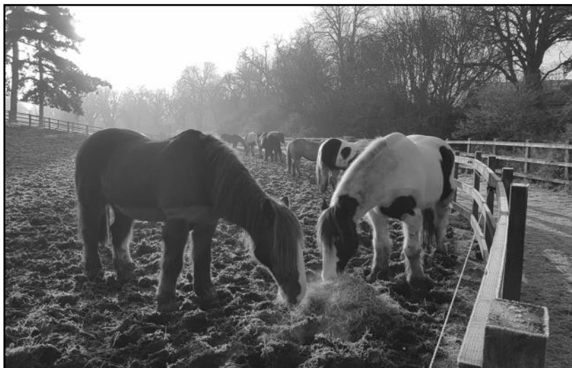
“Mmmm we do love our hay”

Charity No. 1137217; Company No. 7302917