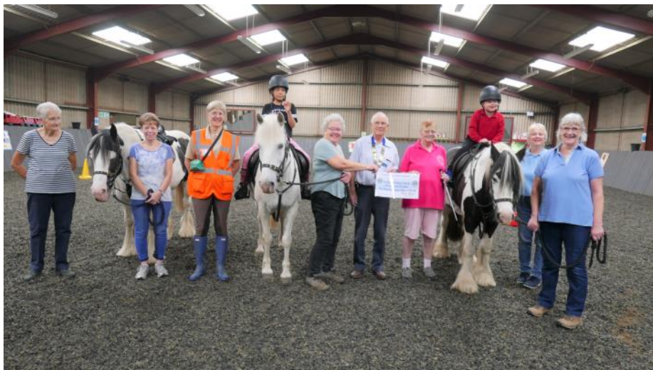
Greeting the Lions

Charity No. 1137217; Company No. 7302917