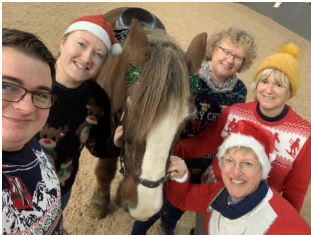
A number of riders from all sessions took part in the Christmas Dressage... Volunteers catch a quick selfie before the hard work began...